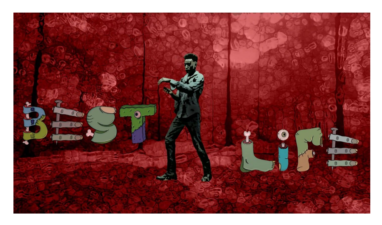
What the final product came out after a few hours of trying different effects in after effects.