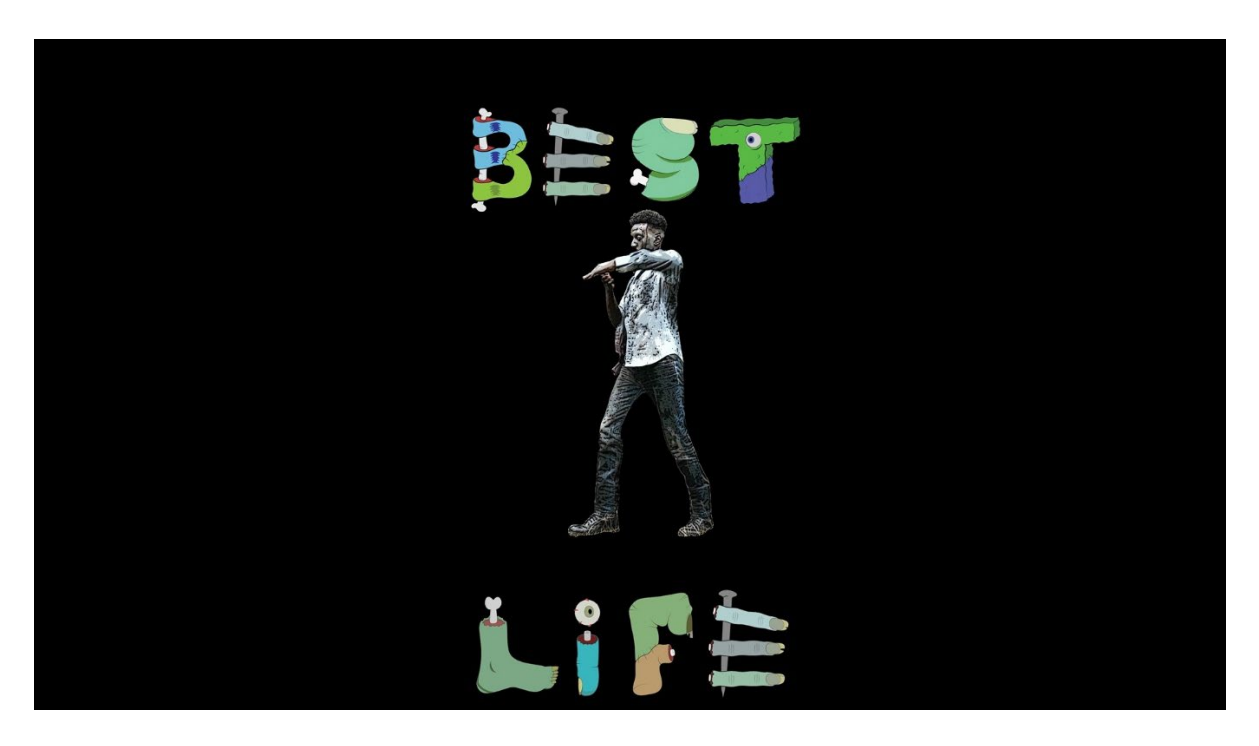
My first attempt at my final product. At first I was pretty confused about what to do for this project. After I switched to this idea I started piecing effects and elements together until I got something I was content with.