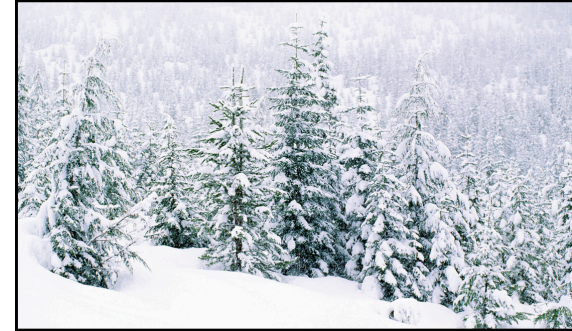
Scene 2 Shot 5 Panel 9

VO: Winter descends, smothering life under a white shroud.