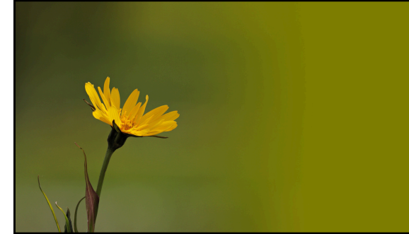
Scene 3 Shot 5 Panel 15