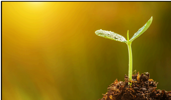
Scene 1 Shot 4 Panel 4

VO: Fragile, uncertain, yet relentless... its first leaves unfold to greet a hostile world.