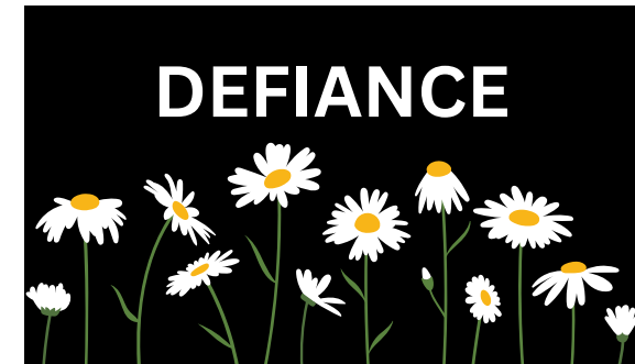
Scene 4 Shot 3 Panel 18