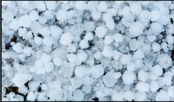
Scene 2 Shot 3 Panel 7