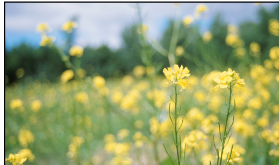
Scene 4 Shot 2 Panel 17

VO: This is defiance: not in noise, not in battle... but in the quiet refusal to give up.