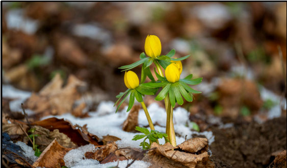
Scene 2 Shot 6 Panel 10