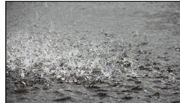
Scene 2 Shot 2 Panel 6

VO: The rains arrive in torrents, drenching the newborn with indifference.