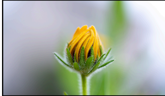
Scene 3 Shot 3 Panel 13

VO: Slowly, impossibly, our little friend persists.