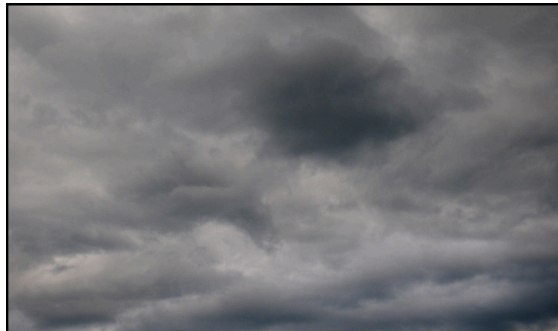
Scene 2 Shot 1 Panel 5

VO: But the world is not kind and few possess the strength needed to survive.