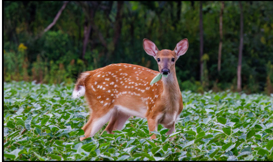
Scene 2 Shot 4 Panel 8

VO: With the arrival of the sun, comes predators