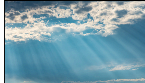
Scene 3 Shot 2 Panel 12

VO: Light returns. And with it— opportunity.