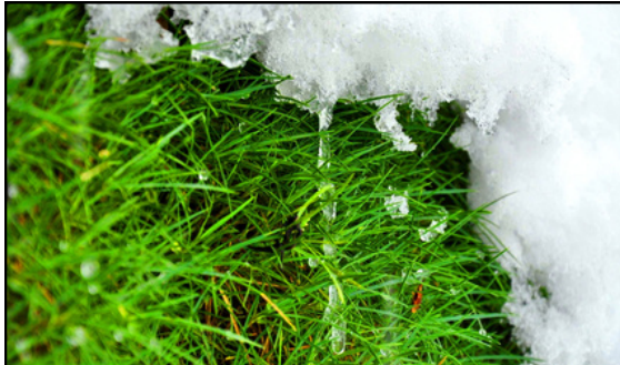
Scene 3 Shot 1 Panel 11