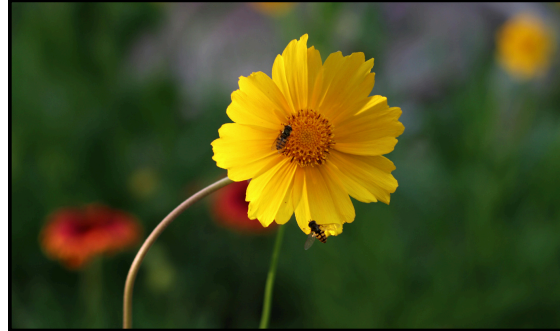
Scene 3 Shot 4 Panel 14

VO: At last, the moment arrives. Against every force of nature, it declares itself... not with thunder, not with violence... but with color.