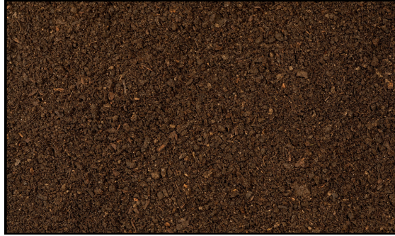
Scene 1 Shot 2 Panel 2

VO: From the darkness of the soil, life stirs. A single seed, anonymous and fragile, begins its improbable journey.