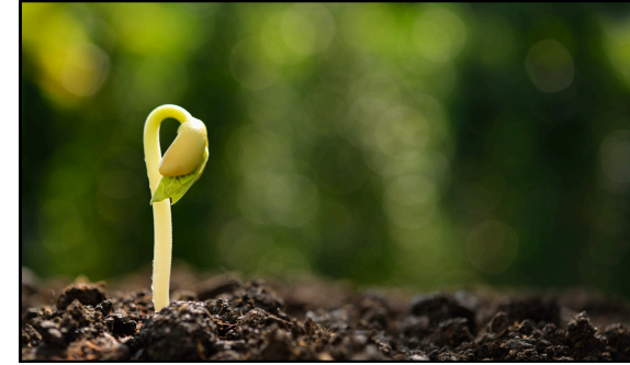
Scene 1 Shot 3 Panel 3

VO: With nothing more than stubborn will, it pushes forth... against gravity, against indifference... toward the sun.